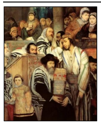
Why has God rejected us his chosen people?

A large section in Romans (9-11) is now given to the case of Israel. At the time this epistle was written the church was comprised largely of Jewish believers. There were difficulties to be cleared up. One serious problem for the Jew was how could God reject his chosen people?